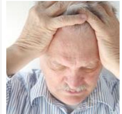
Embarrassment or unwillingness to discuss problem