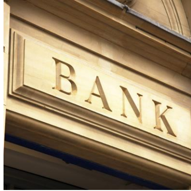
Large or unexplained bank withdraws