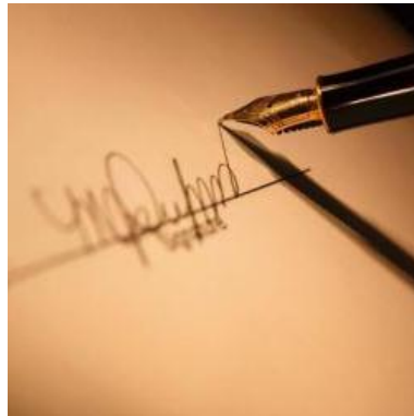
Forgery or suspicious signatures