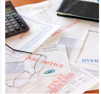
Insufficient funds activity or unpaid bills