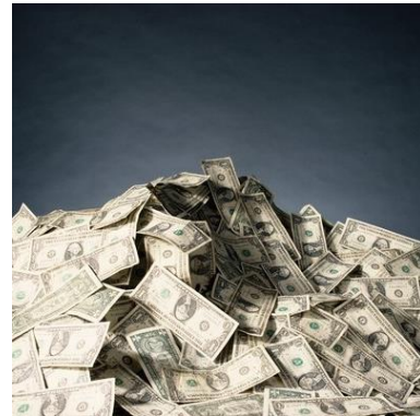
Wiring or mailing large sums of money