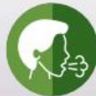
Tetanus, Diphtheria & Pertussis (TDP)